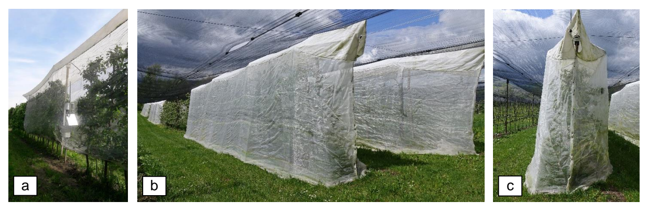
Figure 1: The Keep in touch (KT) cover system was closed above the ground at LAIM (a), and on the ground at FiBL (b, c).