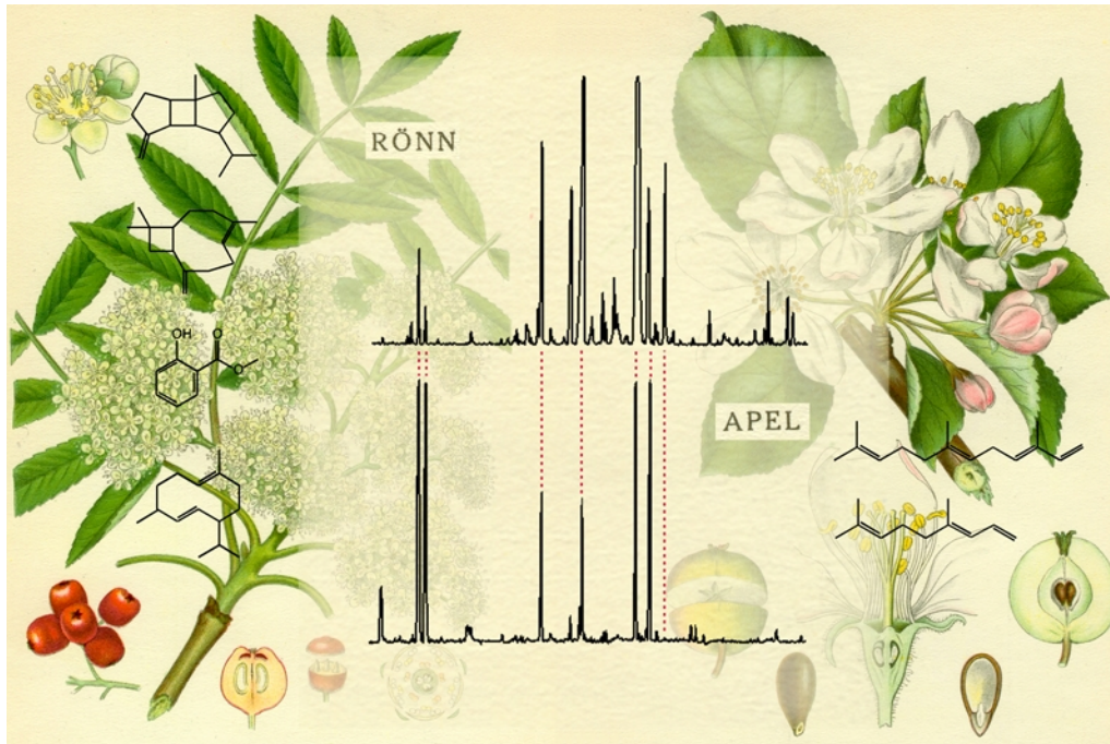
Figure 1. Preliminary results from GC-MS and GC-EAD experiments with volatiles emitted from apples and rowan. Dotted line indicates female response to the compound in GC-EAD.

In 2002 several of the compounds that elicited a reaction in female antennae in the GC-EAD were tested in field trapping tests, from which results from one test is shown here (Figure 2). The other compounds tested did not catch as many females or males as 2-phenyl ethanol and anethol in combination.