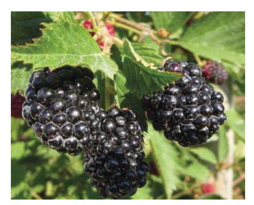
Figure 2: Black berries with white blotches after 4 applications of DS-lime 2.

Lime treatments can cause white blotches. Figure 2 illustrate black berry fruits immediately after the 4<sup>th</sup> application of DS-lime and Proagro surface-active agent (DS-lime 2) in the field. Figure 3 show the fruits after 4 treatments with insecticides and the different DS-lime variants in the market. No complaints were recorded in there.