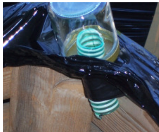
Figure 1: Eclectors for assessment of overwintering CM in the field trials and in the boxes

For the assessment, at the stem of each tree shortly before the beginning of CM flight, an eclector with dark fleece material and rubber foam was applied (figure 1). At the top of this eclector a glued honey glass was installed to capture the adult moths flying against the light. It seemed, that the hatching was remarkably retarded by the eclector. Furthermore, not all moths went into the glass. Thus, when the eclector was removed, the stem was examined carefully for remainings of hatched pupae. It could happen, that adult moth were found and no remainings of pupae and also pupae and no adult moth.