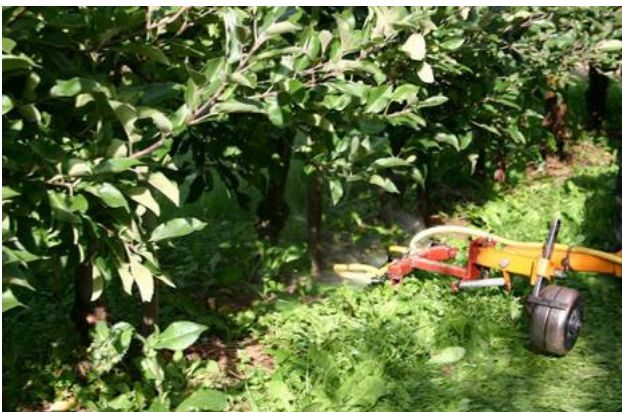
Figure 2: herbicide sprayer with special arrangement for treatment of stems

If only the stems were treated (1 m tree height), the application was carried out with a herbicide sprayers with flatfan nozzles and a special construction (figure 2). If the whole tree was treated, a normal sprayer with flatfan nozzles was used.