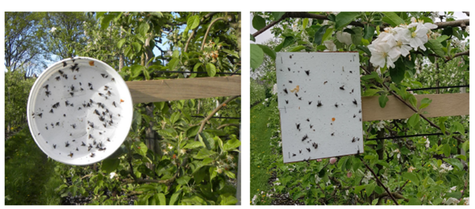
Figure 1. Round plate (treatment E) and the same material attached on a rectangular board (treatment D). Both traps have the same surface (300 cm<sup>2</sup>).

Table 1: Trap types and materials used in trap comparison experiment, 2018.