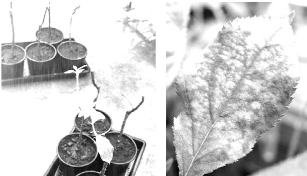
Figure 1: Efficiency test in the greenhouse. Left: Application of test preparations to apple shoots during the germination period under simulated rainfall. Right: Untreated apple leaf 20 days after inoculation. Approximately 60% of the leaf surface is covered with sporulating scab lesions.

Efficacy test. Five to ten leaves with conidia of V. inaequalis were thawed and shaken in tap water to obtain conidial suspensions. The three youngest completely unfolded leaves of the apple shoots were spray inoculated with 1 \times 10^5 conidia/ml until runoff and subsequently incubated at 18°C and 100% relative humidity for 20 h in the dark. The plants were subsequently kept under greenhouse conditions as described above. Test preparations were applied with the appropriate concentration either protective (2 hours before inoculation), during germination (5 hours after inoculation on wet leaves or 5 hours after inoculation during simulated rainfall) or curative (24 hours after inoculation on wet or dry leaves). Rainfall was simulated in the greenhouse (fig. 1) with a spray nozzle placed 2 m above the plants and the sprayed water quantity was measured with a pluviometer. 5 to 10 l water /m 2 were applied in 15 min.