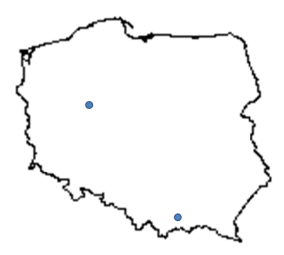
Figure 1: Map showing where Drosophila suzukii was detected on the territory of Poland in 2014 (W. Piotrowski).