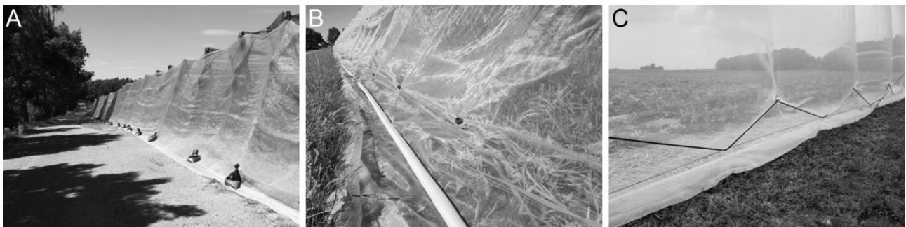
Figure 2: Different types of weighting agents for the ground connection of lateral nettings A) sandbags B) water-filled hose (J.-H. Wiebusch) and C) lateral netting connected with clips and expansion ropes to a steel wire close to the ground (J.-H. Wiebusch)

A tight connection between lateral nets and the ground reduced portals of entry for SWD as well as repair work after strong wind gusts. Many growers used bricks and roof tiles as weighting agents as they were ready at hand or inexpensive. Friction between those weights and lateral nets damaged the Exnet over the years, resulting in multiple minor holes. Sandbags or water-filled hoses as weighting agents caused fewer damages to the nets (Fig. 2A & 2B). One of the growers connected the lateral nettings with clips and expansion ropes to a steel wire close to the ground, which enabled the net to return to its original position after wind gusts (Fig. 2C).